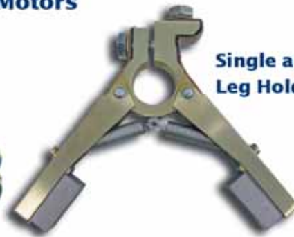
Single and Double Leg Holders