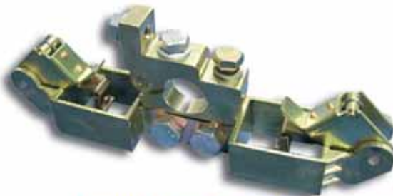
Double Clamp Holders